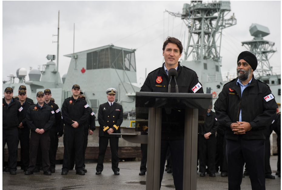
Prime Minister Justin Trudeau and Minister of National Defence Harjit Sajjan

Playing in the premiere league of international security has never been cheap and requires constant investment.