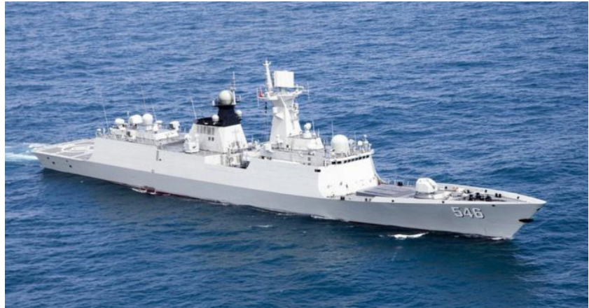
PLA Navy guided-missile frigate Yancheng

Over the past two decades, China has embarked on a military modernization strategy designed to erode American primacy, producing a new military reality in East Asia where Washington remains a formidable and leading military power with strong bilateral alliances and forward deployed forces, but with a reduced ability to move and act unhindered or threatened by ever-improving Chinese sea-denial capabilities. 8 The military buildup by China on reclaimed islets and islands in the SCS is not fundamentally altering the regional balance of power, but is entrenching its occupation of these features, as well as enabling the expanding range and operations of the Chinese navy that is slowly becoming more active globally. Growing Chinese military power, furthermore, seems to be the primary rationale for President Trump’s 350-ship navy concept. The SCS dispute may, therefore, be seen as a litmus test of American resolve to stunt China’s growing military reach and ability to impose its will on others. President Trump has largely