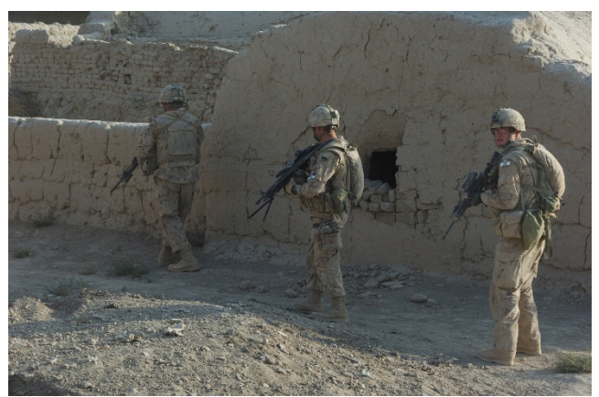
Figure 3. The Canadian mission in Afghanistan may not have been sustainable without support from Canadian defence industries.

It is in this context that defence exports such as the large Saudi purchase of armoured vehicles need to be viewed. Without in any way diminishing the importance of any of the multiple elements making up that complex issue, including human rights concerns, Canada's national interest cannot be defined by any single one of them — be it national security, or economics, or human rights, or any other factor. It has to be defined by finding an appropriate balance between multiple factors. Those who focus their arguments solely on a single one seriously undermine the strength and validity of their case, and substantially misrepresent the complex nature of the issue.