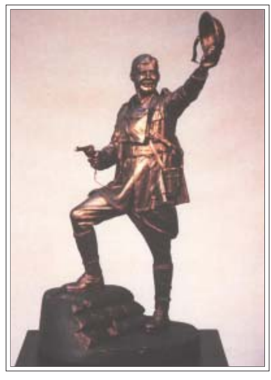
The Vimy Award/La Distinction honorifique Vimy

For more information, including ticket orders for the Award dinner, contact the Conference of Defence Associations Institute at the above address, or fax (613) 236 8191; e-mail pao@cda-cdai.ca; or telephone (613) 236 9903.