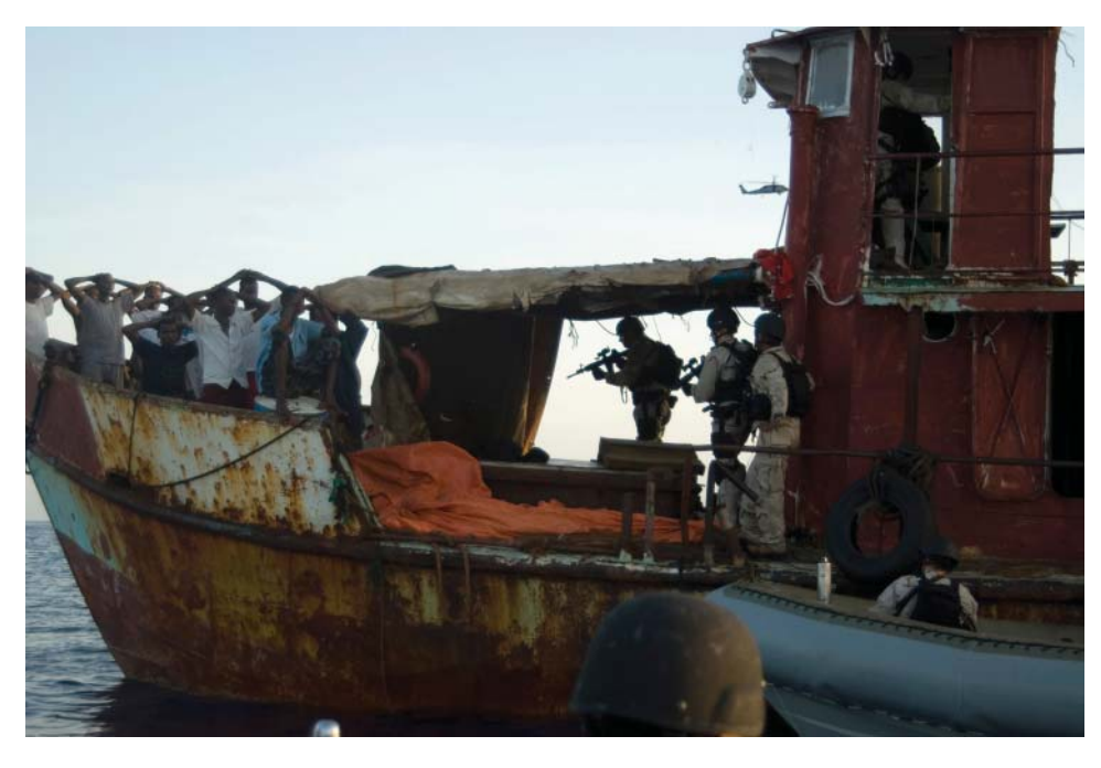
090513-N-0743B-144 GULF OF ADEN (May 13, 2009) Members of a visit, board, search and seizure (VBSS) team from the guided-missile cruiser USS Gettysburg (CG 64) and U.S.

adjacent to the Indian Ocean each year, transporting cargo that includes 12 percent of the world's daily oil supply. Significantly reducing criminal acts at sea in an area that stretches the distance from San Diego to Seattle, however, poses significant logistical, operational, and political challenges. To counter the threat, nations have for the first time begun to employ maritime power in the Horn of Africa. A multinational coalition of naval forces associated with the US Fifth Fleet in Bahrain operates in the Gulf of Aden, the Red Sea, the Arabian Gulf and the Western Indian Ocean. Under Combined Maritime Forces (CMF), Combined Task Force (CTF)-150 conducts Maritime Security Operations (MSO) to deter maritime terrorism and promote the rule of law at sea in the Horn of Africa.