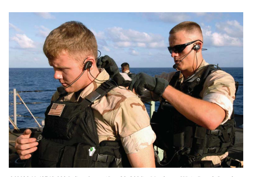
060128-N-4374S-003 Indian Ocean (Jan. 28, 2006) - Members of Visit, Board, Search and Seizure (VBSS) team, assigned to the dock landing ship USS Carter Hall (LSD 50), perform gear checks as they prepare to conduct a master consent boarding aboard an Indian cargo dhow.

The first few months of 2009 demonstrate that large numbers of foreign warships can have a positive effect with a reduction in successful attacks, but piracy continues to threaten the critical sea line of communication connecting the Suez Canal to the Arabian Sea. Vice Admiral William E. Gortney, Commander of the US Fifth Fleet, testified before Congress in March 2009 that pirate capacity has been impacted by the seizure or destruction of twenty-eight pirate vessels, and the confiscation of 133 small arms, twenty-eight Rocket Propelled Grenades (RPGs), fifty-one RPG projectiles, and twenty-one ladders and grappling hooks. Ships are especially vulnerable if they fail to operate within the recommended transit areas or follow preventative guidance. Of fifteen pirate attacks in the Gulf of Aden in late 2008, ten involved ships that were operating outside the IMO's recom-