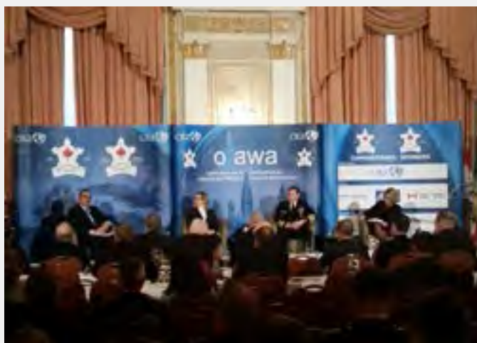
Panel 2: New Cyber Challenges in the 21st Century.

This year’s event proved to be especially timely, with the Honourable Jason Kenney providing his first public address in his new role as Minister of National Defence. Minister Kenney used his time at the Ottawa Conference to hint publicly that the Canadian mission to Iraq – Operation Impact – will be extended. Indeed, on 24 February, soon after the conclusion of this conference, Canadian CF-18s taking part in coalition operations